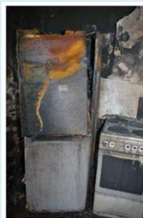
Refrigerator that started the fire [2]

It was a fire on late night, and the fire spread rapidly and it leads to delayed evacuation, resulting in the deaths of 70 people.