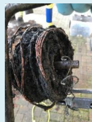
Case of fire ignited by reel-type cable