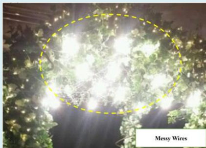
Wedding store ceiling lighting and ambient conditions[3]